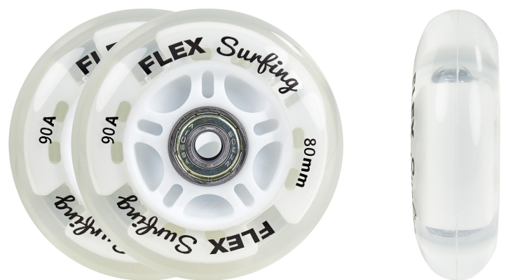
LIGHT UP WHEELS